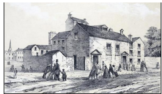
1740 at The Foundery in London.

Amplified text and references may be found at: https://en.wikipedia.org/wiki/Christ_the_Lord_ls_Risen_Today